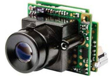
Shown with optional lens