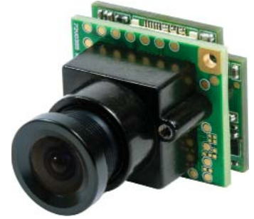
Quick adaptations possible to meet your volume production needs.