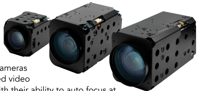
Photo ID Cameras

Our zoom block cameras have revolutionized video project designs with their ability to auto focus at an infinite number of positions in a very small package.